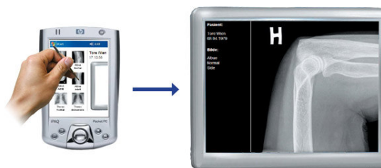
Figure 4. Screen extension

Screen extension (Figure 4) implies that the handheld and the PC are logically interconnected so that objects can be dragged between the devices. When the user drags an object on the handheld towards the screen edge, it will appear on the PC screen.