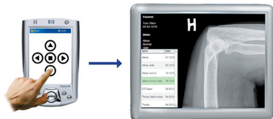
Figure 6. The handheld as a remote control for the PC.

The remote control technique lets the user control the PC by tapping buttons on the handheld’s screen (Figure 6). The up and down buttons let the user move between choices in menus.