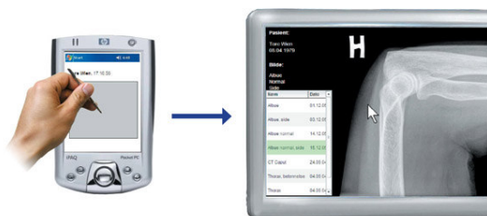
Figure 5: The PDA as input device

One way of integrating PDAs and other devices is by letting the PDA replace existing input devices.