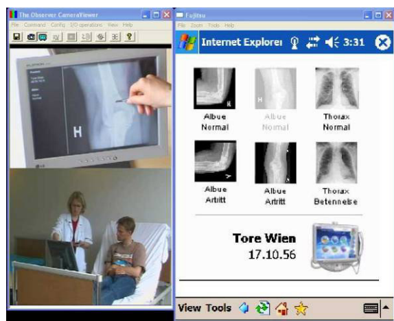
Figure 10. Video recording showing the test participants, the patient terminal, and the PDA content.