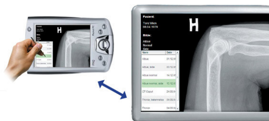
Figure 9. Mirroring.

Current windowing systems allow for two screens to display the same content. In our case, mirroring implies that the handheld is showing a continuously updated copy of the PC-screen where all the changes on one are reflected on the other.