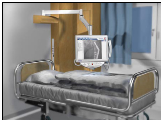
Figure 1. The patient terminal

The patient terminal is basically a PC where all input and output is done through a touch screen. The patient terminal is mounted on a movable arm (see Figure 1), so that it can be moved according to the patient's or staff's preferences.