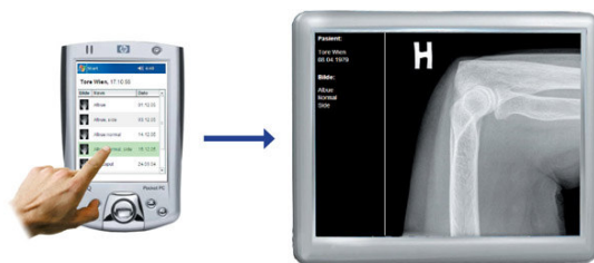
Figure 7. WIMP on PDA

The technique shown in Figure 7 is similar to the baseline design, but the WIMP navigation is done on the PDA instead of on the PC. When the user makes a selection on the PDA, the object that it refers to is shown on the patient terminal.