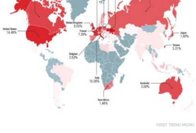
Figure 3. Breakdown of the remaining infections by country

https://blog.talosintelligence.com/vpnfilter/