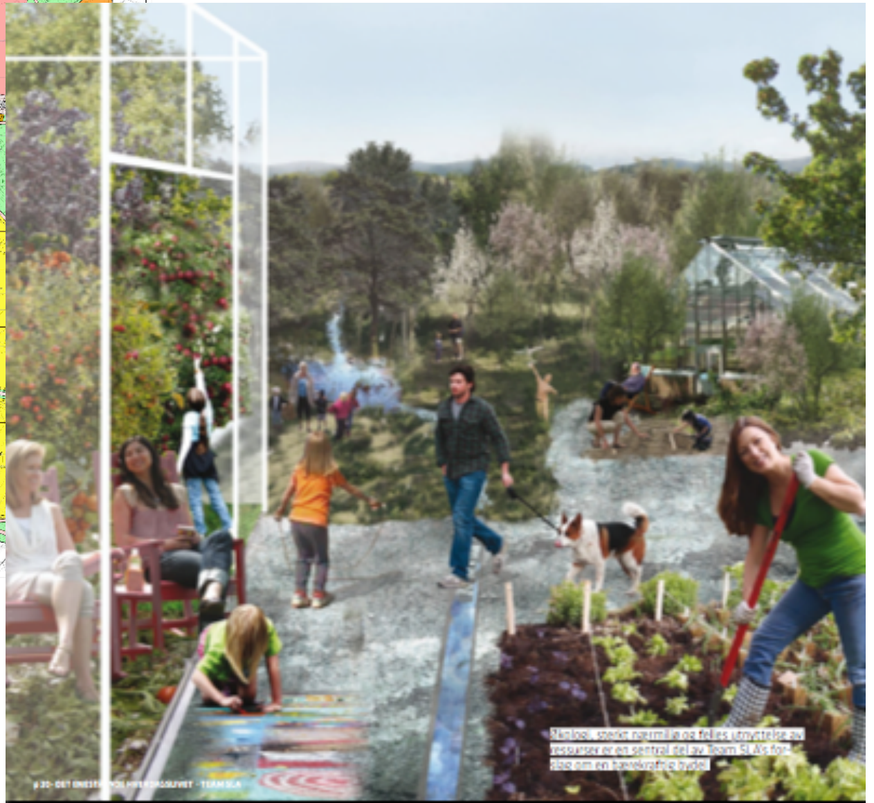
Alm. foto. somt nærliggende felles utvokstede av utvokstede og kontroll del av Team SIA for del av en kommunalt hage