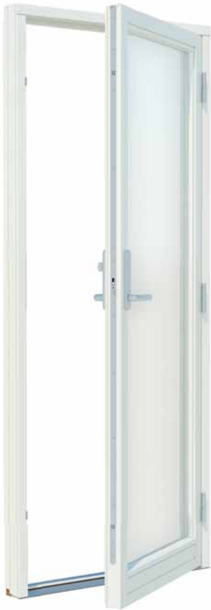
■ NorDan's outward opening balcony door, exterior view