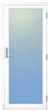
Exterior view, closed position