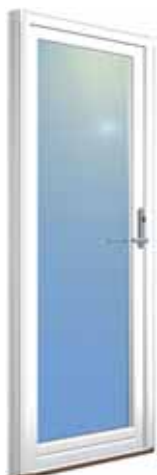
Interior view, closed position

NOTE: Size limitations also depend on the weight of the glazing, for further information please contact your nearest NorDan office.