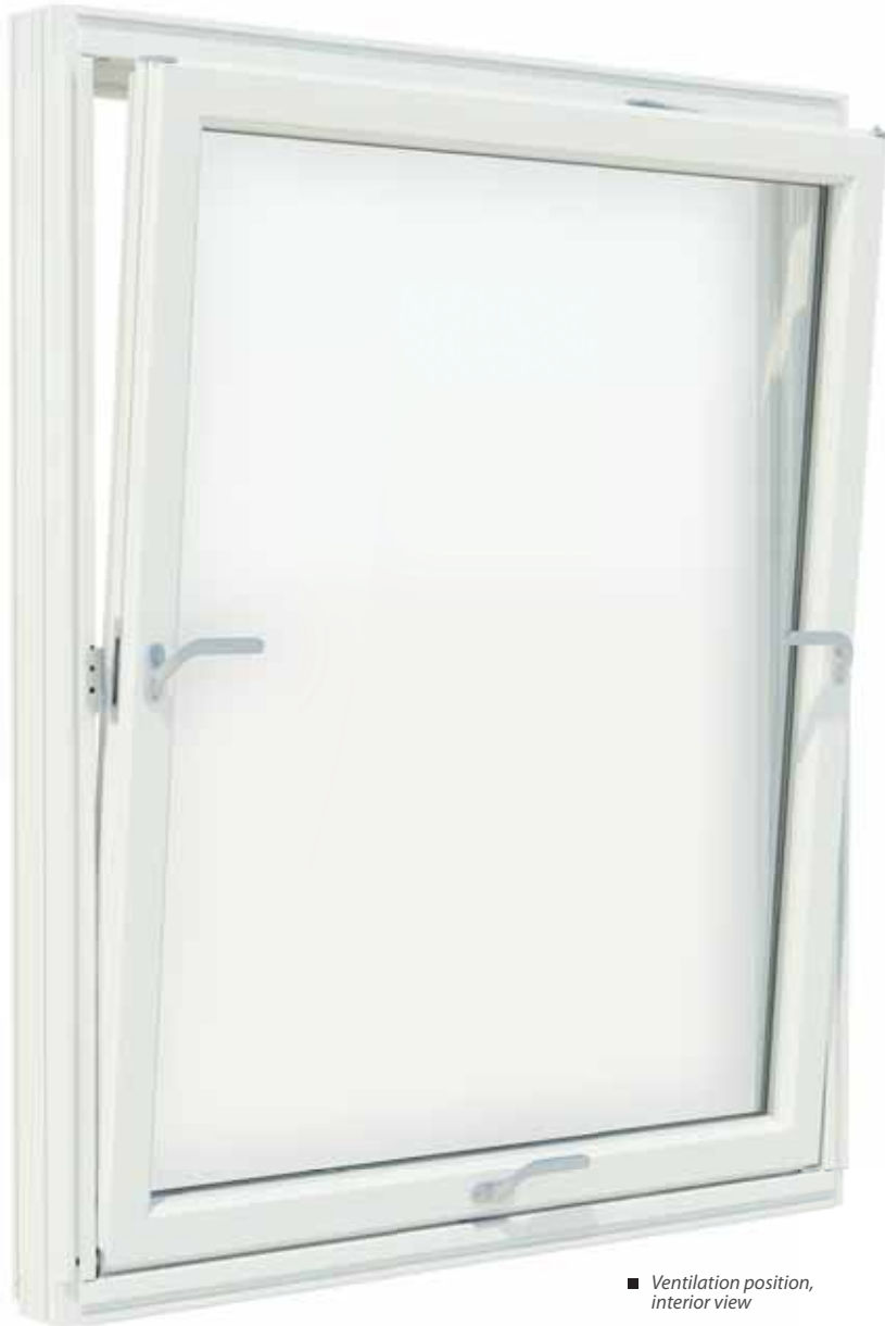
■ Ventilation position, interior view