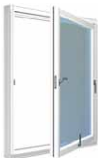
Cleaning position, interior view