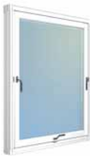
Closed position, interior view