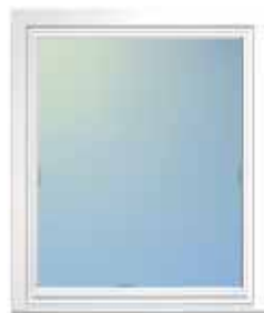
Closed position, exterior view standard timber