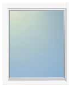
Closed position, exterior view aluminium clad