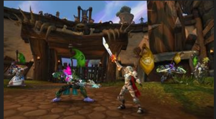
PvP in WoW