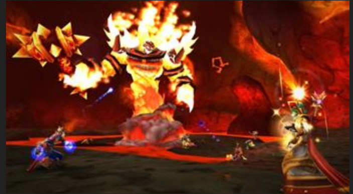
PvE in WoW