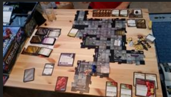
Dungeons and Dragons