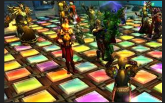
Dance event in WoW