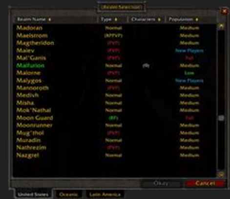
“Realm” selection in WoW