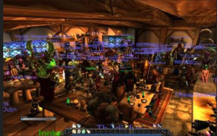
Gathering of players in WoW