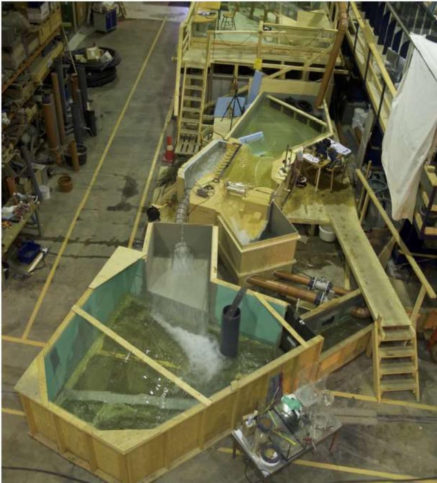
Figure 2-1: Physical model of closed conduit spillway at Storlivatn

In recent years, several physical model studies of closed conduit spillways have been carried out at the hydrotechnical laboratory at NTNU, and there is currently an operational model of a new spillway at Storlivatn (see picture below) which is suitable for making physical experiments on closed conduits.