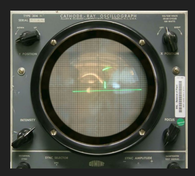
Tennis for Two (1958)