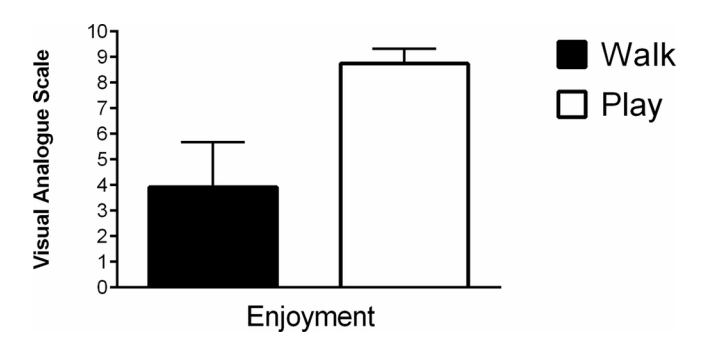
Figure 4 Self-rated level of enjoyment during WALK (black bar) and PLAY (white bar). Error bars represent SD.

Perceived enjoyment of an activity is an important determinant for the time allocated to an activity. In general, people are inclined to undertake activities that make them feel good and to avoid activities that do