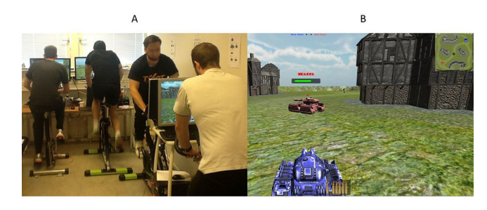
Figure 1 (A) Experimental set-up of PLAY. (B) The Pedal Tanks exergame.

respectively). Immediately after each session, the participants rated their perceived exertion and enjoyment of the activity on 10 cm 0–10 Visual Analogue Scales (VAS).