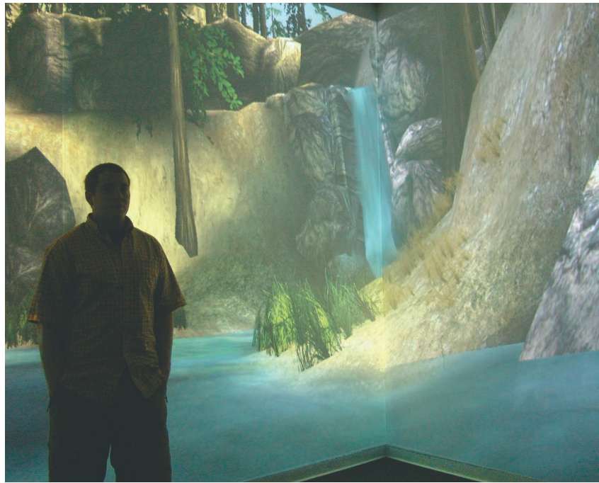
Figure 2. Virtual Theater, University of Pittsburgh's Information Sciences Department. The user can manipulate virtual objects or navigate using standard game peripherals.

Sciences Center ( http://visc.exp.sis.pitt.edu/projects/707.asp ) use CaveUT to prototype systems for first-responder emergency training, virtual museums, way-finding applications, and architectural planning.