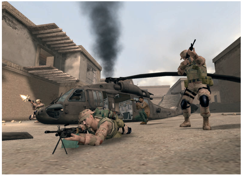
Figure 2. America’s Army . The most widely used and successful serious game to date, this title initially served as a recruiting tool.

These comments led us to wonder how much of K-12 science and math education could be taught via games and how we might exploit students’ capability for collateral learning —the learning that happens by some mechanism other than formal teaching. Ultimately, we wondered if we could incorporate all K-12 science and math education