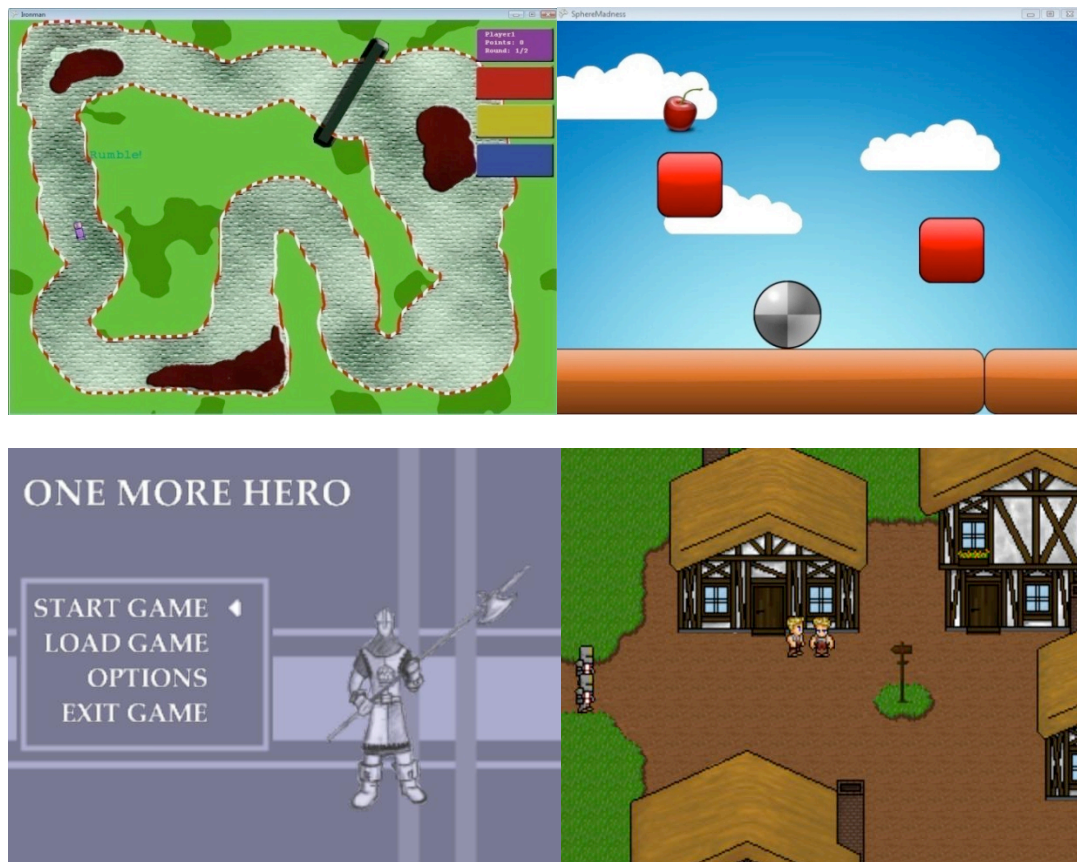
Figure 3. Game based on XNA framework (Top left: Racing; Top right: Codename Gordon; Bottom: RPG)

Figure 3 shows screenshots from four student game projects. The game at upper left corner is a racing game, the game at the upper right corner is a platform game, and the two games below are role-playing games (RPGs). Some of the XNA games developed were original and interesting. Most games were entertaining, but were lacking contents and more than one level due to time constraints.