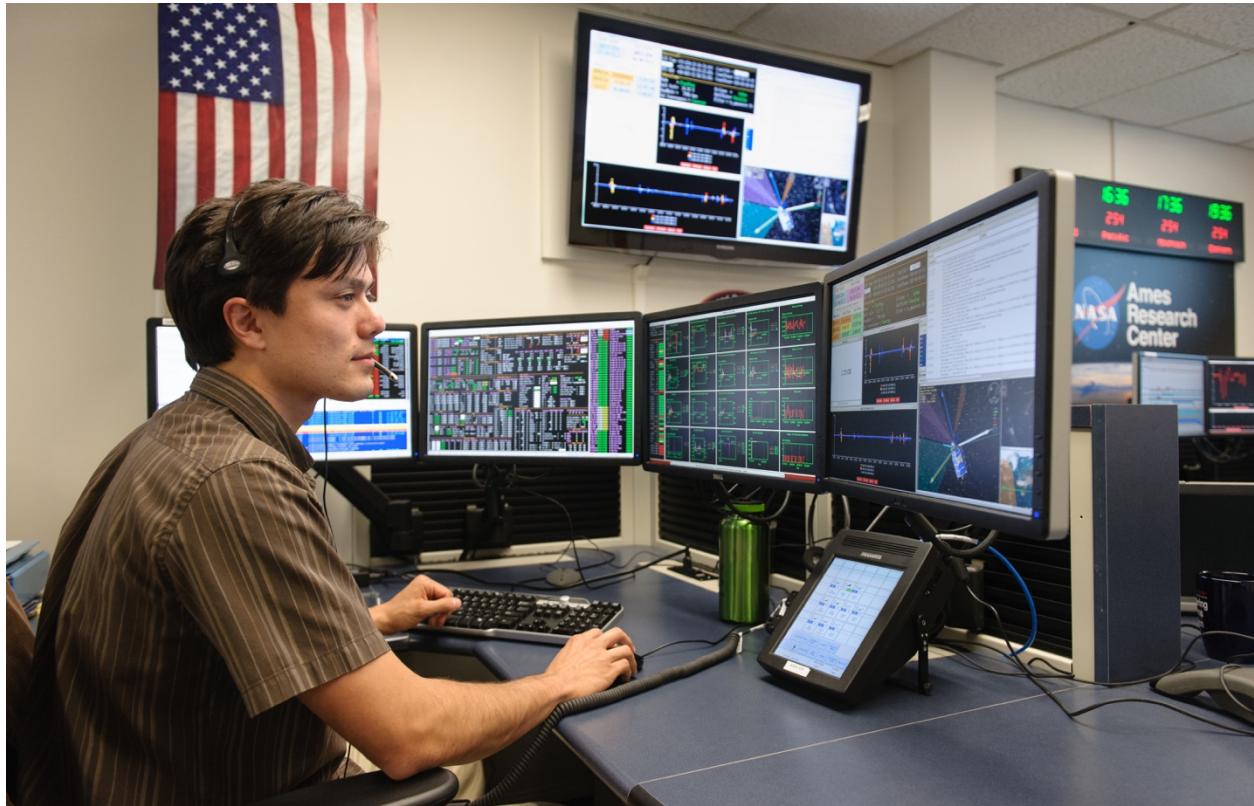
Fig. 1 MMOC Control Center

the LCROSS, Kepler, LADEE and IRIS missions. In addition, it also supports operation of ISS payloads and science instrumentation, such as experiments using ESA's EMCS and technology demonstrations like SPHERES. The Ames Multi-Mission Operations Center (MMOC) was created with the goal of increasing the efficiency of mission support activities and reducing the over-all cost of that support. The MMOC provides the facilities, networks, information technology equipment, software, and system administration services needed by flight projects to perform mission functions and relieves the missions of the burden of procuring and provisioning those things themselves. Because of the diverse nature of the spaceflight missions operating at NASA Ames, the MMOC is challenged to meet the needs of projects that vary in size, complexity and purpose. In this paper, we will describe how we designed and implemented a network architecture to support these disparate mission characteristics and how we structured and manage our information system security plan to document each mission's unique requirements, without becoming unwieldy or expensive.