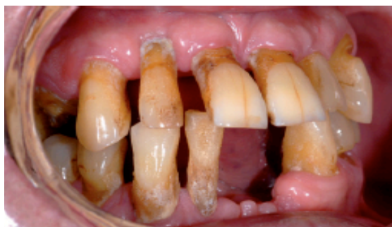
Figure 1. A patient with untreated periodontal disease.

Periodontal diseases are recognized and well-documented complications of diabetes (10,15,24). The evidence supporting this relationship is based on epidemiologic data and animal model studies that help explain the pathophysiology of periodontal disease as a complication of diabetes (10,26). Data suggest that periodontal diseases also may increase the risk of experiencing poor metabolic control (10,12,15).