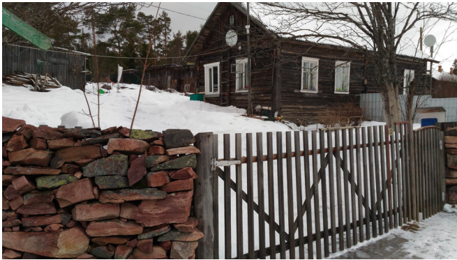
Fig. 3, 4. Pieces of diabase and quartzite used as decorations next to the houses in Rybreka and Shoksha villages.