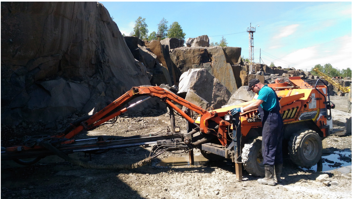
Fig. 2. Mining worker at a diabase quarry in Rybreka.

the production of glass. After the fall of the Soviet Union, due to financial difficulties of the 1990s, state mining enterprises were partly closed, partly sold to private owners. The quartzite extraction near Shoksha almost stopped (it is managed by a small-scale private enterprise with approximately twenty workers). Diabase extraction is maintained by several private companies of different sizes, mostly located near Rybreka village. Throughout the Soviet time and in the post-Soviet period, the mining quarries of diabase and quartzite remained the primary employment sources in Veps villages (see Fig. 2).