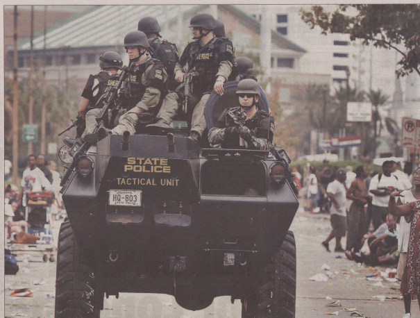
ENORM OPPGAVE: En pansert bil med væpnet politikkjøllet i går inn i New Orleans gater. Væpnete gjenger kontrollerer nå store deler av sentrum og myndighetene mangler ressurser.

Tilskudd: Lars Inge Staveland Hjelpen er fortsatt ødelagt. Vi snakker om snakk utfor for å få strøm igjen i området, sier han.