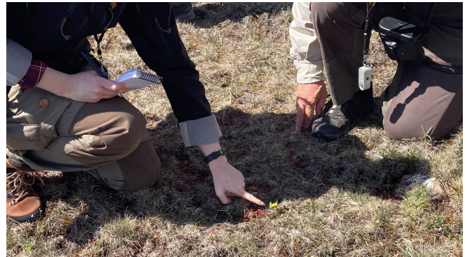
Figure 1. Two participants are kneeling on the ground, trying to identify a dandelion

During the time of identification, the species started to take the shape of epistemic objects in the sense that they opened up for questions, fostering further inquiry (cf. Knorr Cetina, 2001). A prominent example of this was the effort to identify dandelions, of which there are more than 900 microspecies in the Nordic countries. Being able to describe and identify a dandelion by eyesight was, hence, no easy task, but the utilisation of a magnifying loupe enabled this practice to a greater degree. In Figure 1, both the loupe and the notebook are visible as tools used by the participants for trying to make sense of the flower in question, establishing an epistemic object. The leaves, the buds and the details provided indicators that can be recognised either by field guides or via the experience-based knowledge shared between participants.