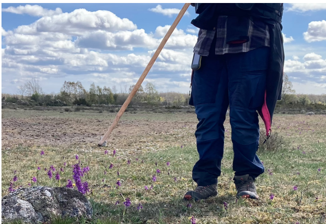
Figure 2. The excursion leader points with a walking stick towards an orchid, directing the participants' attention. Other equipment includes a Dictaphone (top), a GPS tracker (on the waist) and a wearable loudspeaker system

Aiding the group guidance, the excursion leader was in possession of several other tools that helped shape the practices, as is visible in Figure 2. To ensure that all participants could hear the description of the flora and the milieu, the leader wore a vest with patched-on loudspeakers, amplifying the statements uttered through a headset. This, in turn, provided a way to sonically follow the events of the tour even if a participant lingered and was not at all times physically located in direct proximity to the leader or the site currently under scrutiny. Species documentation was primarily conducted through a Dictaphone, recording the species mentioned by the leader and the questions coming from the association members. Another device used was a GPS tracker, tracing the path that the leader took throughout the site. Both the Dictaphone and the GPS tracker were analytically understood as inscription devices (cf. Latour & Woolgar, 1986; Law, 2004); the Dictaphone recorded speech to digital audio files and the GPS tracker converted the trail from non-trace-like to trace-like form. Altogether, these tools shaped the temporal and spatial aspects of the identified species through digital stamps in the recorded sound file and through geographic positions in the GPS tracker, respectively.