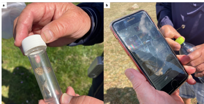
Figure 3. (a) Two at the time unidentified insects sampled in a tube from a sweeping net and (b) a strain of Sesleria uliginosa identified through the image recognition application Google Lens

Another tool used for sampling findings at the excursion, albeit in a slightly different form, was that of the image recognition-supported smartphone application Google Lens, integrated into the official Google search app. Through such an app, primarily used by two participants in the excursion, it was possible to identify species on the fly with the aid of deep learning technology. As seen in Figure 3b, two participants identified a strain of Sesleria uliginosa using the smartphone application. The identification was not unproblematic as it depended on human-nature alignment. The participants described how hands shivering when holding the strain of grass made it difficult for the application to parse the image seen through the camera. Likewise, the wind blowing on the little strain made it flutter, and the need for good lighting was considered crucial for the image recognition to be correctly conducted. Apparently, the application mistook an O. mascula for a Muscari botryoides , implying another instance of classificatory negotiations. Through continual use, the epistemic objects emerged in relation to the image recognition app.