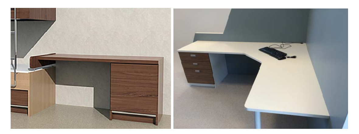
Figure 5. "Simple" tables.

For example, a 'simple table' (see Figure 5) can be round, rounded, oval or rectangular. It can be a stand-alone table, connected to other tables, or for example a corner table. Thickness, length, width, top color, edge color, and the type of corners are all specified by the customer. Edges are dependent on position. For example, a table in a corner will not have edging on the parts that connect to the walls. If the table is stand-alone, then it may have four legs in a type and color specified by the customer. However, legs may not be necessary where there is a drawer section, or where the table is connected to a wall or to another piece of furniture.