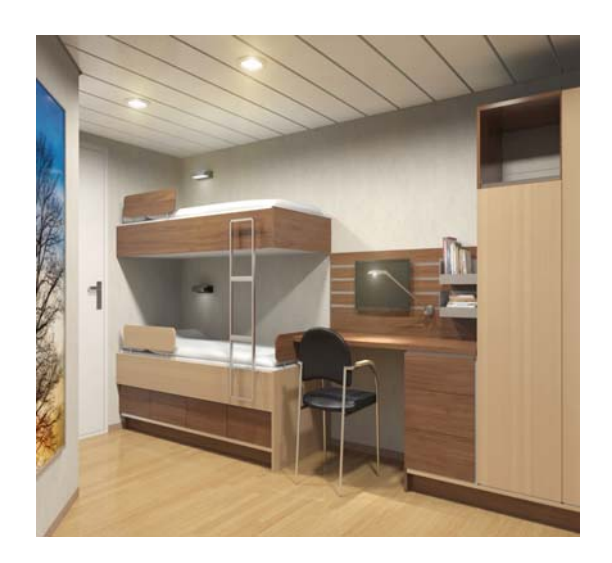
Figure 4. A cabin.

ShipNor AS was founded in 2013. The objective of the business is to produce furniture for ships. This includes bunks, tables, cupboards, shelves, and so on (Figure 4). Modern vessels such as those that support oil exploration and production at sea may have several hundred cabins. In addition, there may be a large number of offices. Furniture for ships requires a better quality than standard furniture. Due to the fact that ships move, drawers need a locking system so that they remain closed in heavy seas, tables need to be bolted together, bunks need guards, and tables may need sea rails. However, the main difference is in the customization.