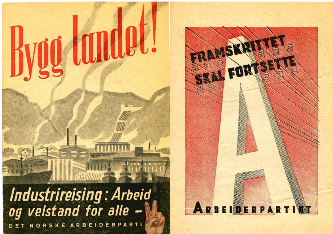
Figure 1: Left: Poster from the Norwegian Labor Party in 1945: “Build the country! Industrial development: Work and progress for all”. Right: Poster from the Norwegian Labor Party in 1953: “Progress must continue”

The engineering profession in Norway has gone through several policy shifts during its more than a hundred years of history. In the 1930's the profession took a turn towards policy in both industrial and labor politics. This coincided with an idea in party political circles where engineers were seen as central to industrialization, which again was seen central to growth and welfare (Nygaard, 2013, p. 48). This continued far into the post war-era, where the Labor party was the dominant political force in Norway and engineering topics were prominent in their propaganda (Figure 1).