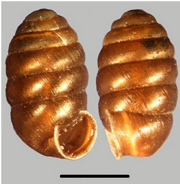
Figure 1. Pupilla pratensis (Clessin, 1871) Sweden, Östergötland, Ombergsliden. Scale bar 1 mm.