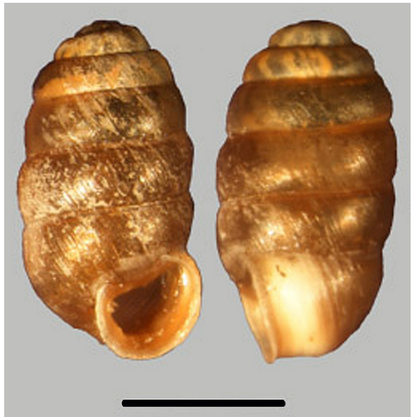
Figure 2. Pupilla muscorum (Linnaeus, 1758) Sweden, Västergötland, Borgunda church. Scale bar 1 mm.