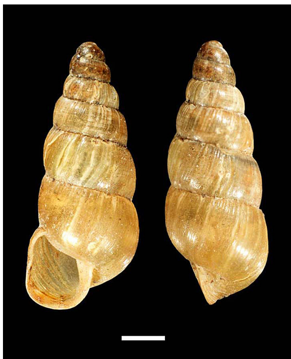
Figure 5. Balea sarsii Philippi, 1847 Norway, Hordaland, Bergen. Scale bar 1 mm.