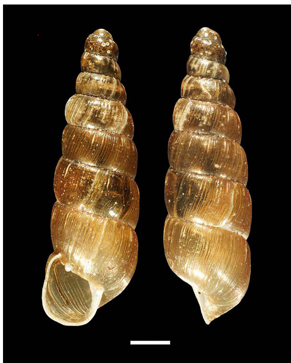
Figure 6. Balea perversa (Linnaeus, 1758) Norway, Telemark, Vråvannet. Scale bar 1 mm.

cal surfaces (rocks, trees etc.) (Boycott 1921). Their main food is lichens, which may also serve as shelter (Baur & Baur 1997). The nine, so far known, Scandinavian localities are all situated close to, and in some cases exposed to, the sea, in a pronounced Atlantic climate, and hence connect well to its so far known European distribution.