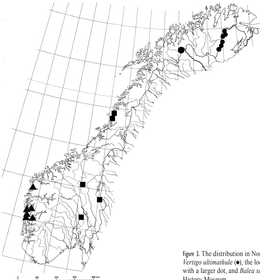
Figure 3. The distribution in Norway of Pupilla pratensis (■); Vertigo ultimathule (●), the locus typicus in Sweden is marked with a larger dot, and Balea sarsii (▲). Map Göteborg Natural History Museum.