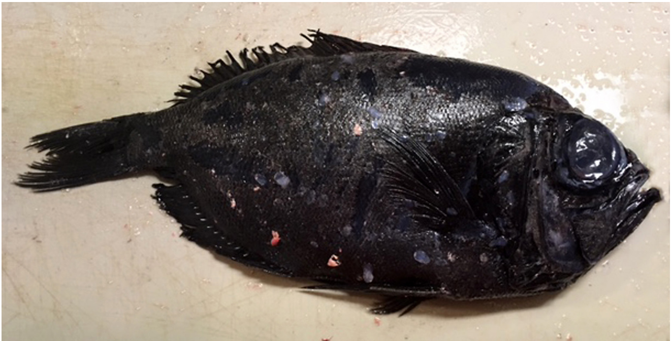
Figure 2. Diretmichthys parini ZMUB 23826, Tromsøflaket 2017, 292 mm SL. By convention, fish should be photographed on their left side, but this was unknown to the photographer when the photo was taken at sea in 2017.

Ingvaldsen et al. 2006), may facilitate such an expansion, perhaps leading to the species' establishment in the Nordic Seas. In fact, a spawning specimen was caught south of Iceland in January 2004, in 6°C water (Jónsson & Pálsson 2013).