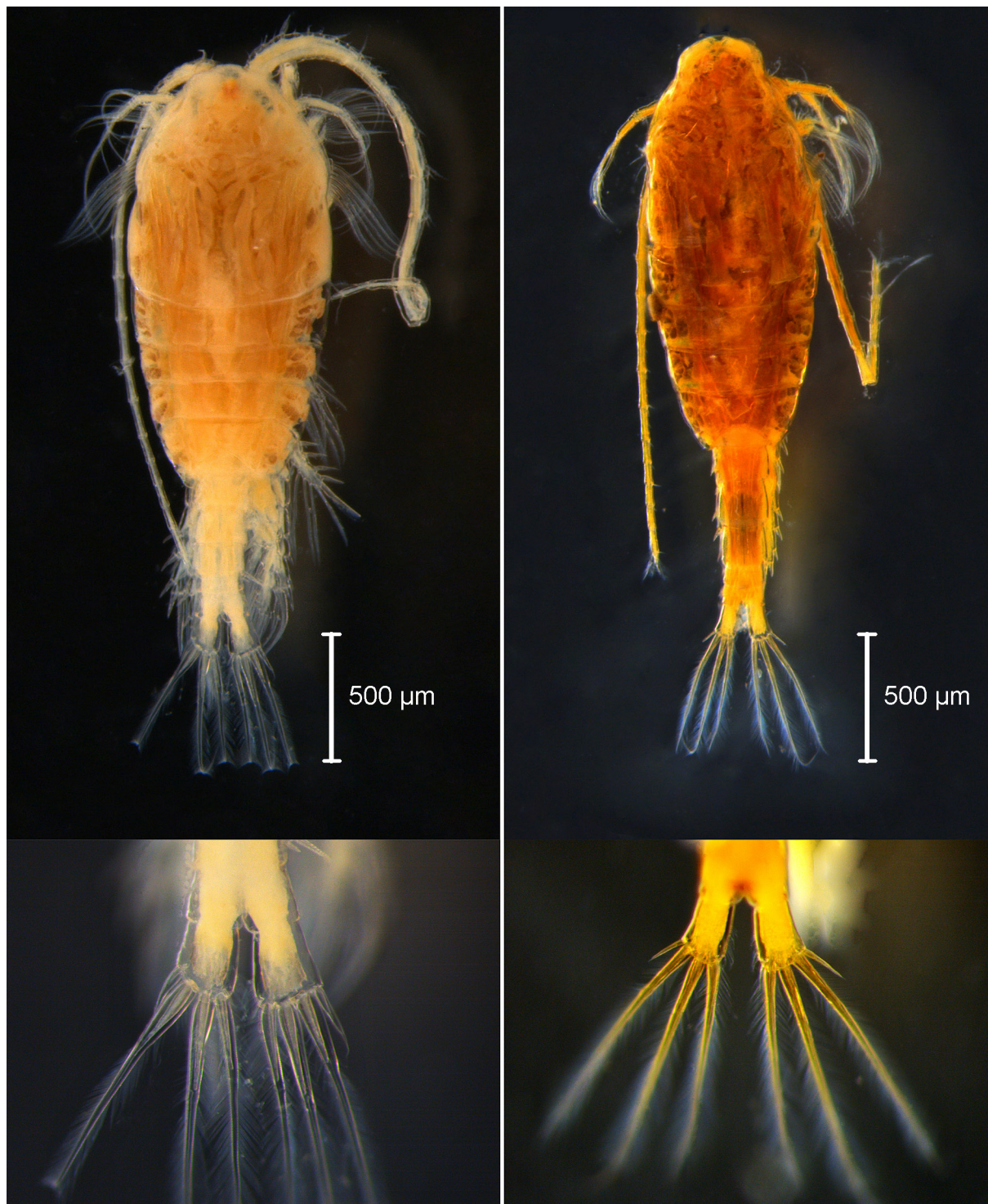
Figure 2. Heterocope borealis (left) and H. saliens (right) males. Inserted enlargements show differences in the shape of caudal rami and proximal parts of apical setae in the two species.