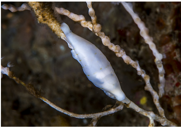
Figure 4. The specimen of Simnia hiscocki from Egersund harbour on the 14 th of March 2017.

Simnia hiscocki was described as a new species based on 34 live-collected specimens from several collecting sites around Plymouth on the southwestern coast of England in 2011. Until now, the species has been found only at the type locality and only on its octocoral host Eunicella verrucosa (Lorenz and Melaun 2011). Simnia hiscocki is here reported from Norway for the first time.