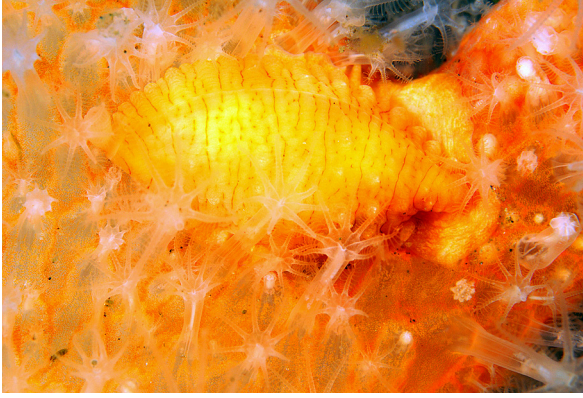
Figure 2. In situ photograph of Simnia patula feeding on Alcyonium digitatum at Brattøy, Kristiansund, Norway, photographed 30 th of March 2016.

typical food resource, in a species rich sample associated with this bottom type. The specimen is deposited in the collections at the NTNU University Museum (NTNU-VM-72481). It has not been possible to find additional specimens despite several later attempts dredging in the same location.