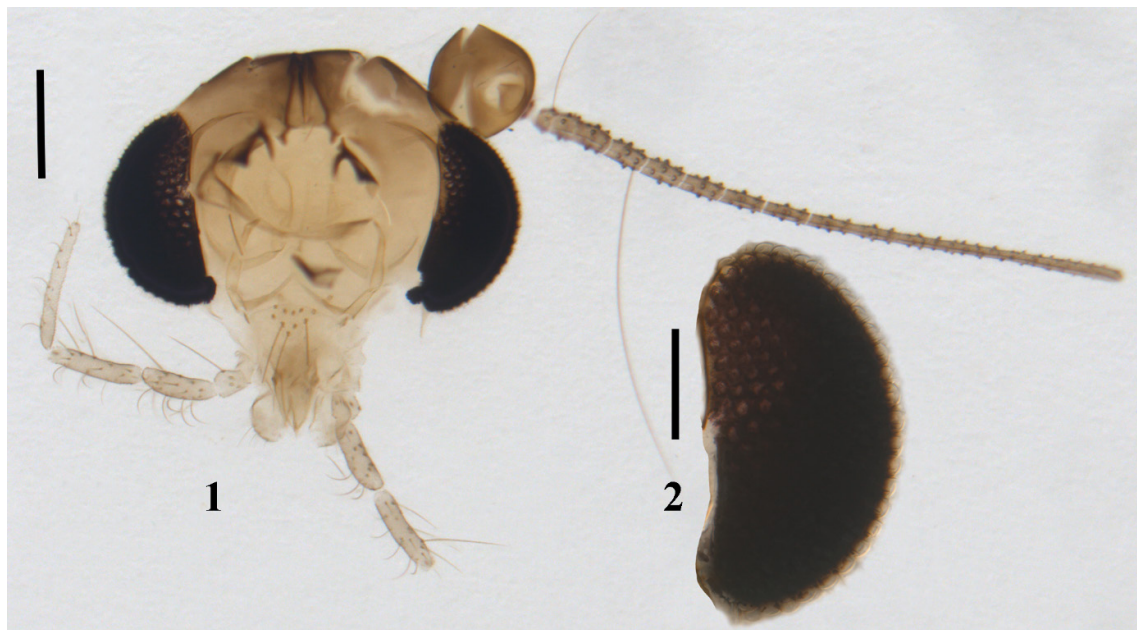
Figures 1–2. Zavrelia bragremia Guo & Wang, 2007, male. 1, head and antenna, scale = 100 \mu\text{m} ; 2, eye, scale = 50 \mu\text{m} .